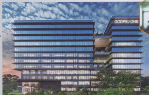
GODREJ ONE - Actual Image

have identified four key real estate markets in India - Mumbai, Pune, NCR & Bangalore and our focus will be to further enhance our position in these markets and become one of the top three real estate players in these markets.