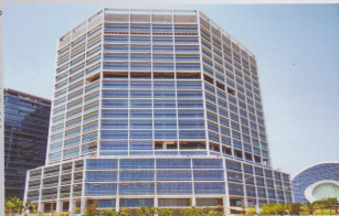
GODREJ BKC - Actual Image

There are many factors that make us stand out from our competitors. First of all our differentiated asset-light model has helped us scale up at a rapid pace. We have also de-centralized our operations thereby bringing in more accountability and focus in our portfolio across the regions we operate in. We have a young work force that brings in a lot of dynamism and optimism in the way we go about doing business. And most of all- the legacy of the Godrej group which is known for trust and transparency. ■