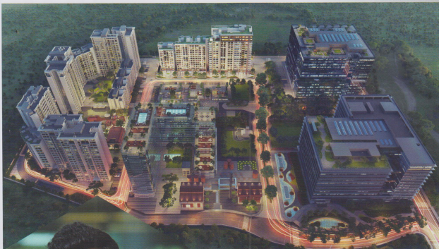
GODREJ ORIGINS 2 Artistic Image